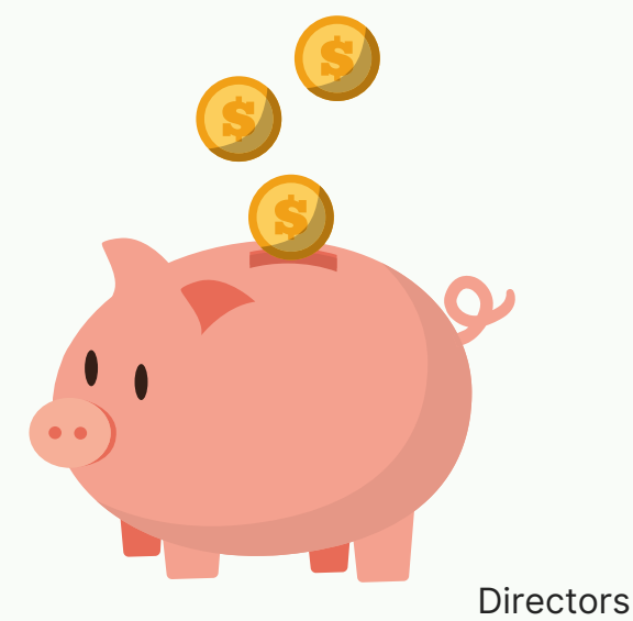
Peter Drew Contracts Ltd

Agree to give or offer, give or offer, a bribe of any sort whatsoever, directly or indirectly, anywhere in the world; or participate in, encourage, authorize, support, or condone corruption of any kind whatsoever, directly or indirectly.