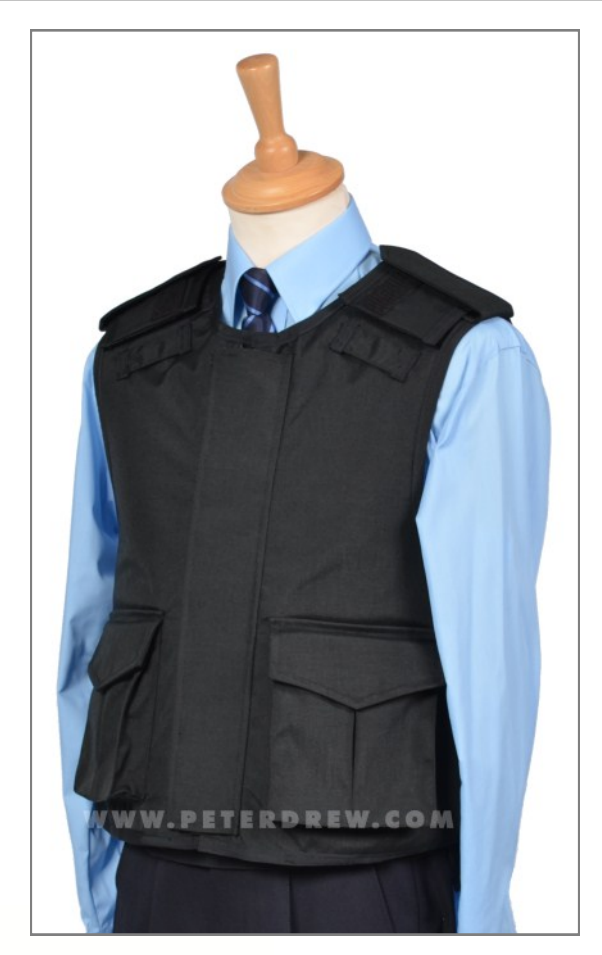
Stab Resistant - From £295.00 Ballistic Resistant - From £395.00