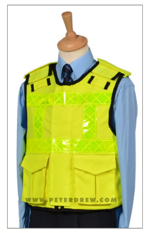
Stab Resistant - From £315.00 Ballistic Resistant - From £415.00